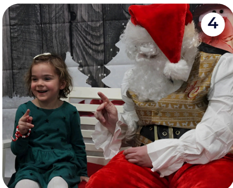
(1) ASL Jr. Explorers work on tie-dye tee shirts (2) and (3) HSDC staff members and volunteers greet visitors at ASL Weekend at the Ohio Renaissance Festival (4) A child enjoys a visit with Signing Santa Claus at our Winter Wonderland Event